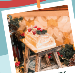
PASSIONFRUIT MERINGUE LOGCAKE