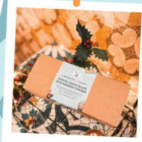
WHITE CHOCOLATE MACADAMIA COOKIES