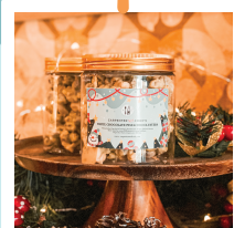
WHITE CHOCOLATE PISTACHIO CLUSTERS