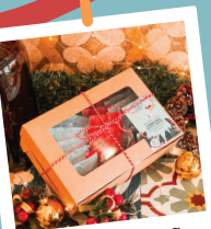
CHRISTMAS BISCUIT MEDLEY