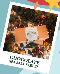
CHOCOLATE SEA SALT SABLES