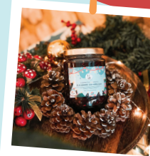
BLACKBERRY AND SHIRAZ JAM