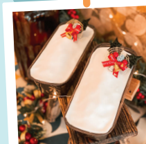
BRANDIED FRUIT CAKE