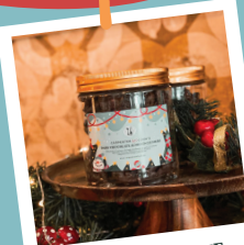
DARK CHOCOLATE ALMOND CLUSTERS