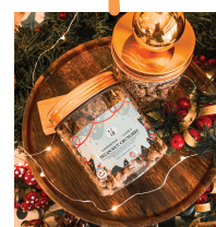
PECAN NUT CRUNCHIES